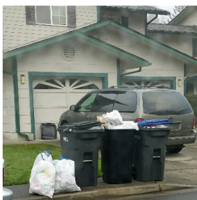
Avoid being charged for someone else's trash