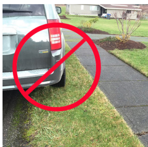
Be considerate of your neighbors: park right