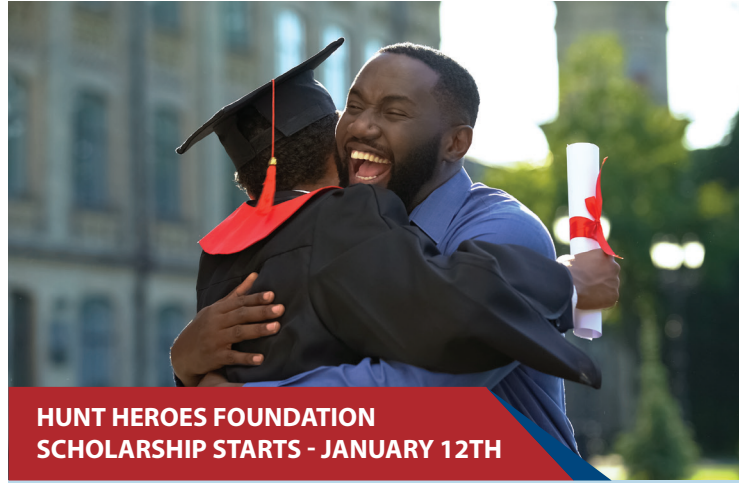
HUNT HEROES FOUNDATION SCHOLARSHIP STARTS - JANUARY 12TH

Enjoy a warm cup of hot chocolate on Tuesday, January 31st, 2023, from 1:00 – 4:00 PM at the Leasing Offices.